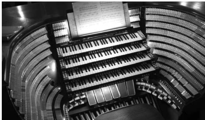
West Point Cadet Chapel console