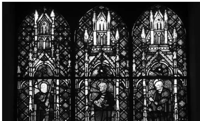
St. Margaret's Episcopal Church's stained glass windows from Chartres.